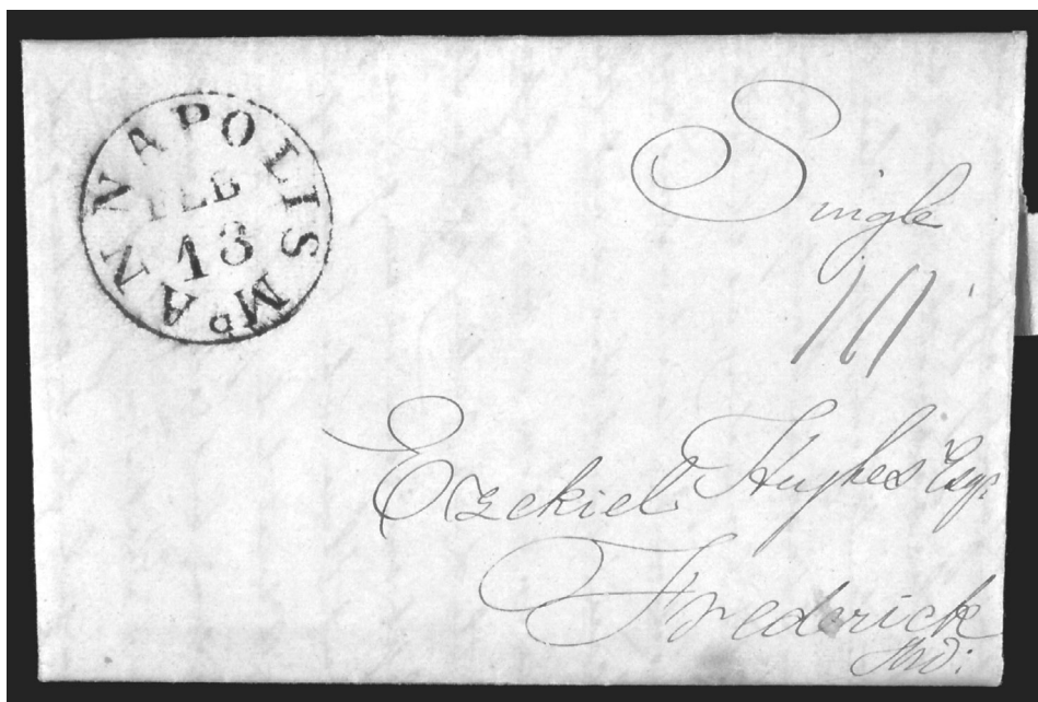
Stampless cover from Annapolis to Frederick, Maryland. Stampless covers are typically folded letters with wax seals mailed before the issuance of postage stamps in 1847 and before the use of stamps became mandatory in 1856. The originating post office wrote or hand stamped its city name. If the postage was collected at the time of mailing, the letter was marked PAID, if not, payment was collected at time of delivery.

The postal system has used a variety of markings to cancel stamps to confirm that the sender made proper payment for the mail's delivery and to ensure that postage stamps are not reused. These postmarks often indicate the time and place of origin, route, destination, and mode of transportation. Archivists should be aware of the more uncommon varieties that are of interest to philatelists and postal historians. 41 Noteworthy originating town marks include those of small towns, discontinued post offices, ghost towns, territories, manuscript cancels, and rural free delivery cancels. Some cancellations or cachets denote unusual post office locations like those in the air, aboard trains, buses, ships, and even on the sea floor. 42