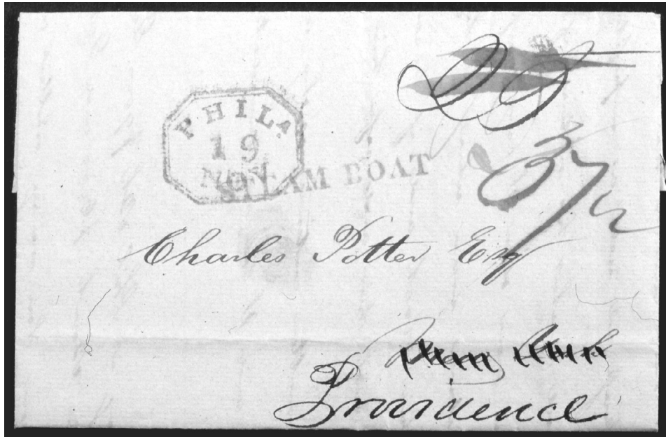
Steamboat cover from Philadelphia to Providence, Rhode Island. The U.S. Post Office officially recognized steamboat mail in 1825. The postmaster at the receiving post office paid the master of the steamboat two cents for each letter received, but this fee was not passed to the recipient. The steamboat hand stamp on this cover was in use from 1832 to 1852 and applied in was Providence where the letter entered the U.S. postal system.

Other markings indicate the covers traveled to remarkable destinations like the North Pole, the Antarctic, and the moon. 43 Cover markings (and some stamps) may indicate unusual means of conveyance such as via tin can, pneumatic post, balloon, inland waterway, packet boat, steamboat, pony express, early railroad or airmail, and rocket. 44 Some postal markings indicate the route the mail traveled and its destination. These receiving marks indicate how long the letter was in transit and any changes in the route taken.