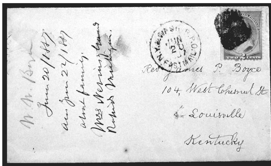
1887 railway post office fast mail cover to Louisville, Kentucky. A railway post office (RPO) was a railroad car, usually on a passenger train, where mail was sorted en route to speed delivery. Sorting mail aboard moving trains revolutionized mail processing. Profits from RPO contracts helped railroads subsidize a number of otherwise unprofitable passenger routes. Note the abstract added to the cover by the recipient to aid in retrieval from a pigeonhole desk or bundled correspondence. Such abstracts aid in understanding recordkeeping practice in the 19th century.

cancellations such as geometrical figures like stars and concentric circles and organic designs like plant and animal forms, fraternal emblems, hearts, and shields. These uncommon and distinguishing stamp cancellations are of interest to many postal historians. Although U.S. postal regulations usually specified black ink for cancellations, some cities occasionally used red, blue, green, magenta, and, in extremely rare cases, orange or yellow. 45