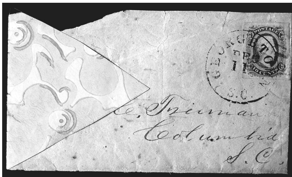
Confederate adversity cover made from wallpaper. By the end of the Civil War, paper was in short supply in the South. Letters and envelopes were fashioned from whatever was available including ledger sheets, printed circulars, maps, and book flyleaves and title pages.

cancellation marks. 72 Because 1,700 different philatelic books have been cataloged, the Library of Congress Subject Headings provides the best resource for controlled-vocabulary general subject terms to describe the wide variety of philatelic materials important to most postal historians. Since 2002, established LC subject headings may be used as genre headings in the 655 field. These headings contain an assortment of narrower subject terms under postage stamps and postal service and a limited number of narrower terms for cancellations, envelopes, and postal stationery.