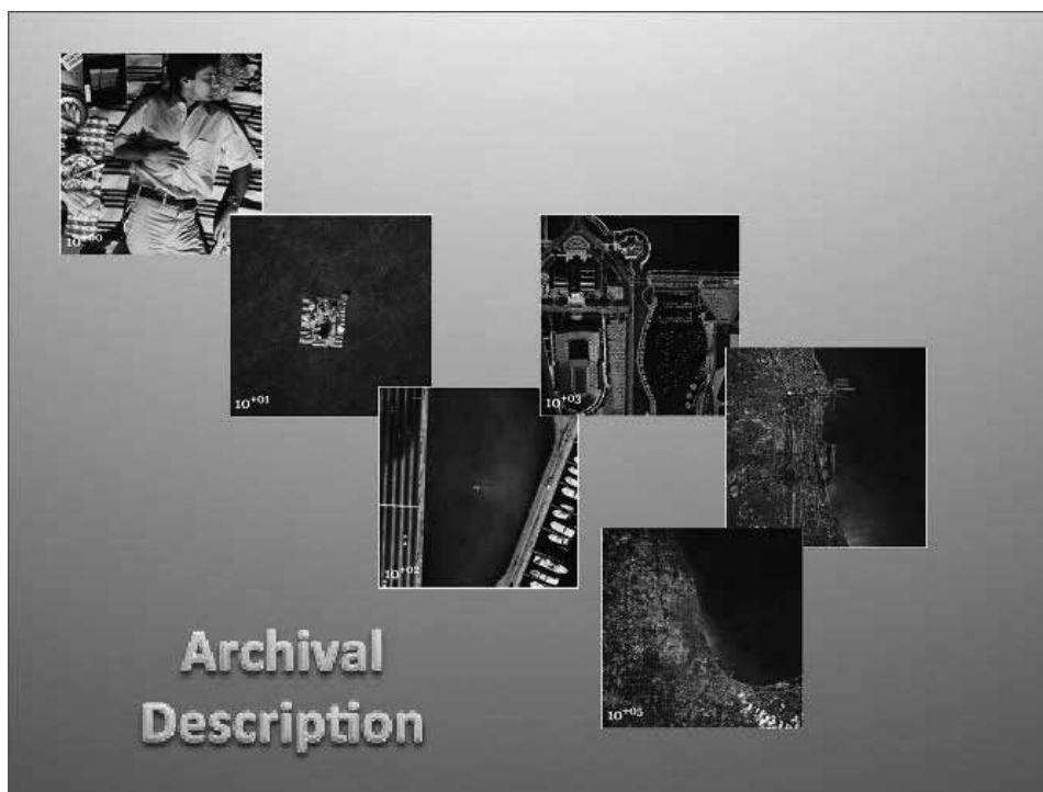
FIGURE 2. Stills from the film Powers of Ten by Charles and Ray Eames.

families, and organizations (see Figure 2). Many of the assumptions underpinning bibliographic data content standards, such as the Anglo-American Cataloging Rules (AACR2) 25 and the recently published Resource Description and Access (RDA) 26 , have very limited relevance for archival control/description. A host of factors influences the balance archivists strive to achieve between any given organic accumulation of materials and the tools adequate for managing and providing access to it, including resources, condition as received, and the extremely relative appraised significance of the accumulated materials. These factors resonate very differently in controlling and describing these materials archivally than they might, if they resonate at all, in the bibliographic endeavor.