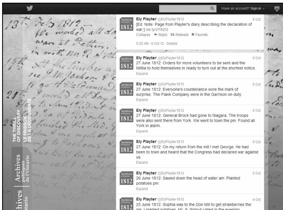
FIGURE 2. This is a screenshot of the Ely Player Twitter account.

declared on 18 June 1812”). These were clearly indicated and kept to a minimum. We aimed to present the diaries without editorializing to allow Player to speak for himself.