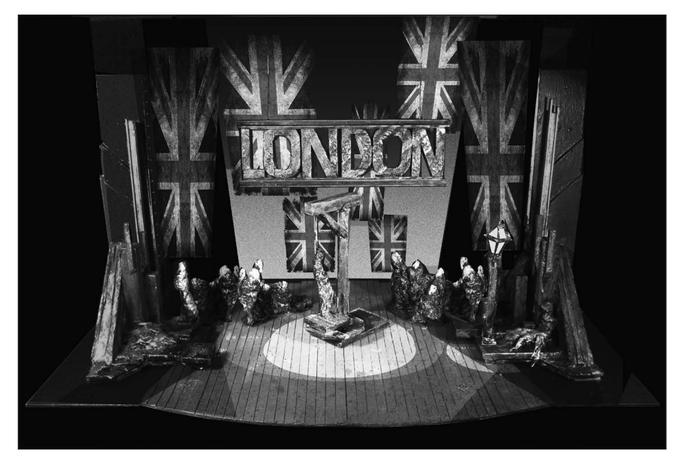
FIGURE 2. The same model photograph appears here with Payne's digital enhancements showing added scenery, lighting effects, and human figures.