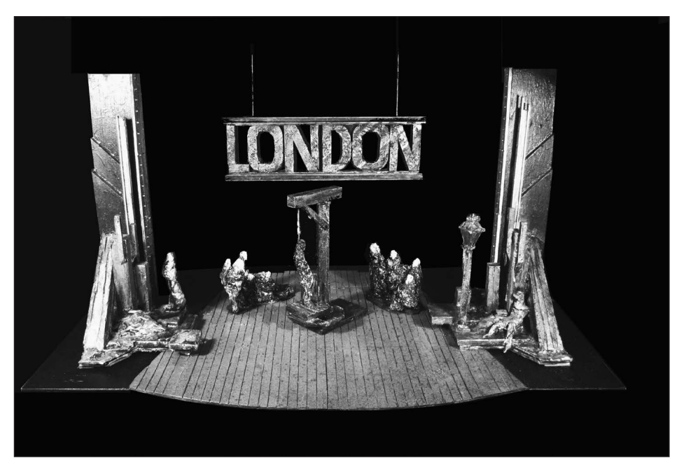
FIGURE 1. A stage configuration created by Darwin Reid Payne for a 1987 production of The Three Penny Opera is shown in this unedited model photograph.

information for both the physical collection and digital surrogates, and adhere to digitization best practices to provide users reliable and trustworthy records. The student worker scanned or photographed the items to preservation standards and created access copies, adjusting color in Photoshop to most accurately render the analog materials digitally. Indeed, the Illinois State Library best practices for digital imaging state: "Create a faithful reproduction of the original. So as not to diminish the historical, cultural accuracy and value of the material, don't attempt to correct or improve the original content." Similar guidelines in government and higher education reinforce this practice.