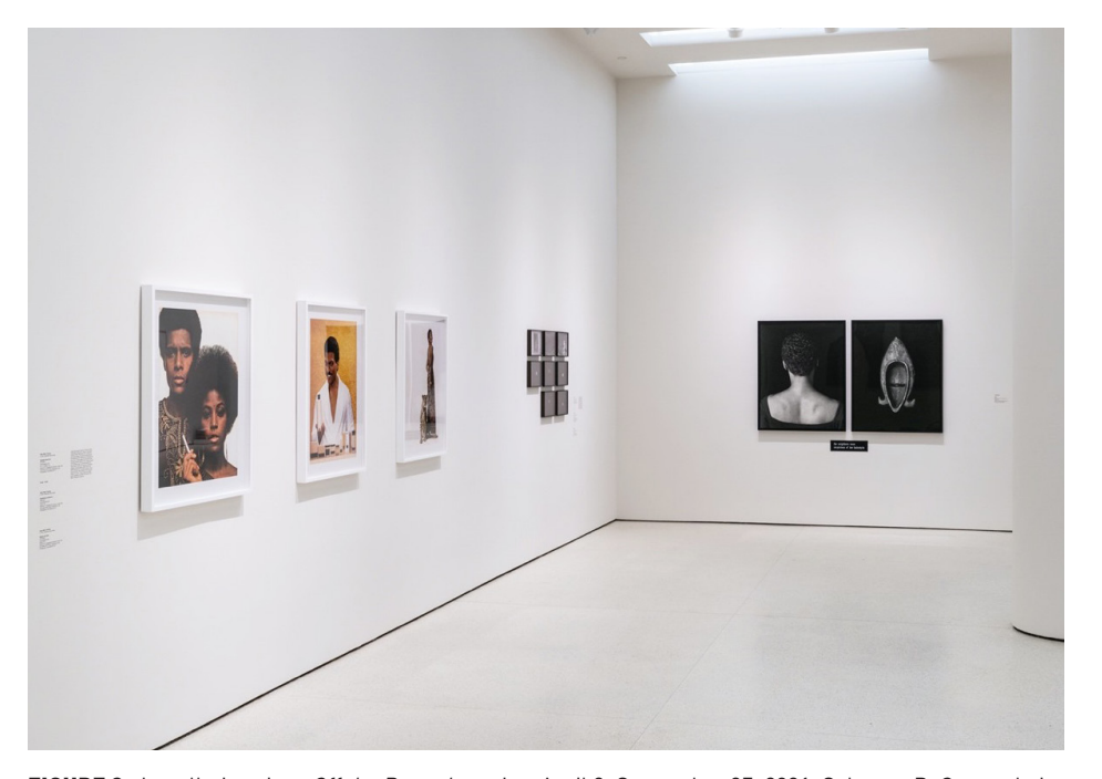
FIGURE 2. Installation view, Off the Record , on view April 2–September 27, 2021, Solomon R. Guggenheim Museum.

A recontextualization of photographs is also performed in three pieces from Leslie Hewitt's Riffs on Real Time (2006–2009) series, which are prints of assemblages of images that place the intimate with the public, the personal with the political. Lisa Oppenheim's prints, Killed Negatives, After Walker Evans