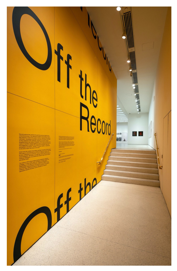
FIGURE 3. Installation view, Off the Record , on view April 2–September 27, 2021, Solomon R. Guggenheim Museum.

The prevalence of black and white in this show, as well as themes of historical and current racism, violence and loss, put Off the Record into conversation with an exhibition at the New Museum: Grief and Grievance: Art and Mourning in America.<sup>6</sup> Conceptualized by Okwui Enwezor before his death in 2019, the exhibition was realized by curators and advisors (including Glenn Ligon) at the New Museum in a tribute to his vision, and, in its way, Off the Record